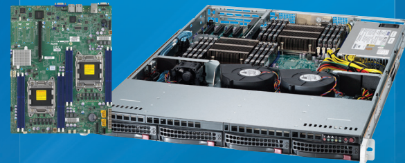
SYS-6017R-TDF+ (Rear I/O) + X9DRD-LF