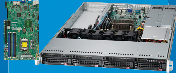
SYS-5017C-URF (Rear I/O) + X9SPU-F