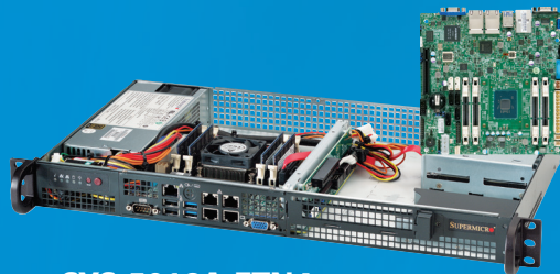
SYS-5018A-FTN4 (Front I/O) + A1SRi-2758F